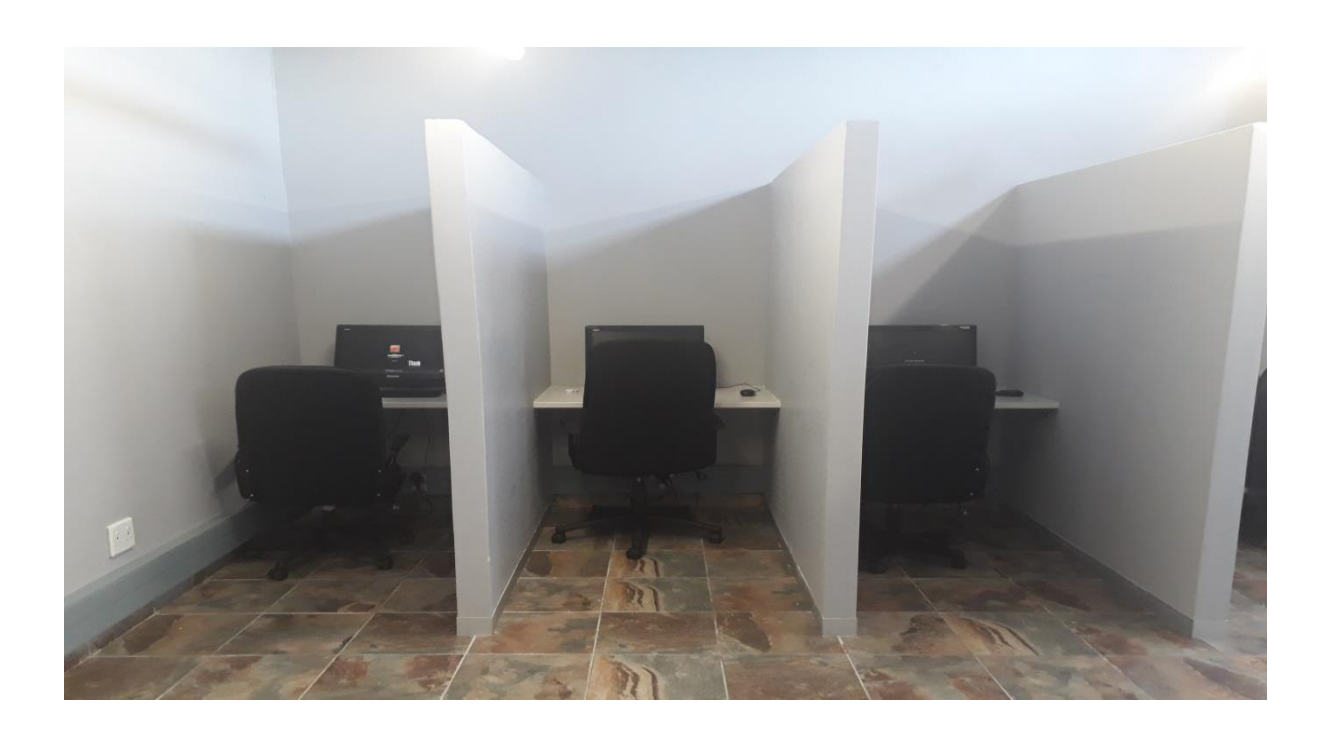
The centre is operational from 7:30am till 4pm Monday to Friday.

community from Ledig and Phatshima which are the door step beneficiaries to Maseve mine which now falls under RBPlats. Within the centre SMMEs are able to use the computer facilities with internet connection, print and scan, in addition to that Royal Bafokeng Enterprise Development, the kvest, Innoven, Ecsponent and RBPlats BEE Procurement Enterprise Development are also operational in the centre to assist with business advises. The centre will give them direct access to the RBPlats BEE Procurement and enterprise development team the kvest along with RBED giving business coaching and mentoring amongst other services. One of their other initiatives was to open up vendor numbers for the door step SMMEs, over 100 vendor numbers have been opened. We were also delighted to note that the centre was renovated by one of the youth SMMEs from the Macharora community who did exceptionally well.