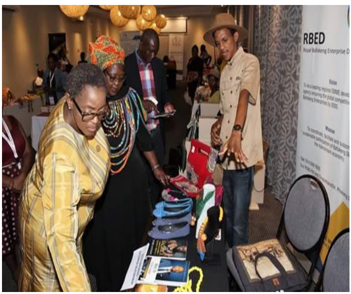
department and department of tourism.

The conference also had a platform for exhibitors to exhibit and sell their products to the attendees during the event. Amongst others was one of our SMMEs who was exhibiting and most of her art work especially diaries were sold out on both days of the conference.