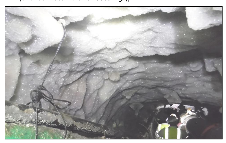
Figure 3: Chlorine levels when not treated