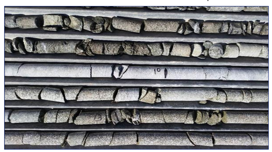
Figure 1: Hex River Pyroxenite intersection

A zone of sympathetic faulting can be expected on both sides (meters away) of the central core fault. This should not be seen as the Hex River fault, and the wider group or zone of faults and jointing should rather be called the Hex River fault zone. This zone can be up to 40 meters wide.