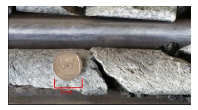
Figure 2: Shearing observed