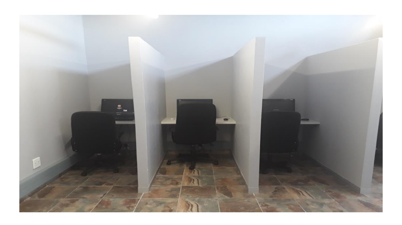
The centre is operational from 7:30am till 4pm Monday to Friday.

community from Ledig and Phatshima which are the door step beneficiaries to Maseve mine which now falls under RBPlats. Within the centre SMMEs are able to use the computer facilities with internet connection, print and scan, in addition to that Royal Bafokeng Enterprise Development, the kvest, Innoven, Ecsponent and RBPlats BEE Procurement Enterprise Development are also operational in the centre to assist with business advises. The centre will give them direct access to the RBPlats BEE Procurement and enterprise development team the kvest along with RBED giving business coaching and mentoring amongst other services. One of their other initiatives was to open up vendor numbers for the door step SMMEs, over 100 vendor numbers have been opened. We were also delighted to note that the centre was renovated by one of the youth SMMEs from the Macharora community who did exceptionally well.