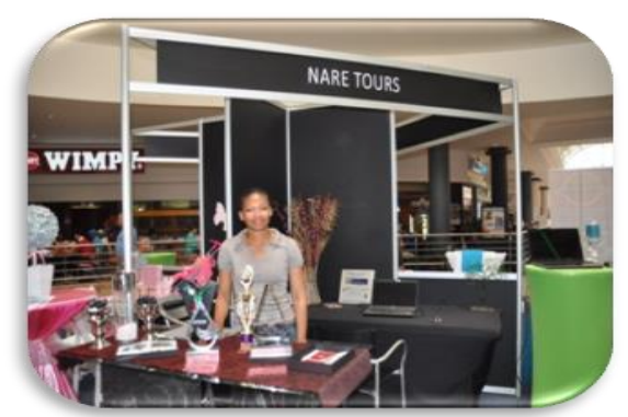
Nare Tours at Waterfall Mall