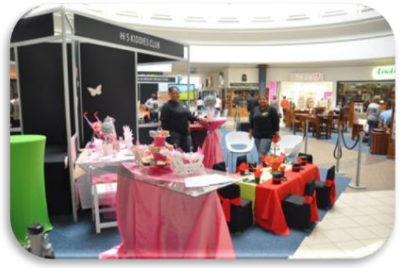
Hi5 Kiddies at Waterfall Mall