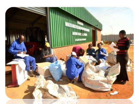
Waste Ease Cooperative Structure

The project has received tremendous support from Anglo Plat and the Department of Environmental affairs. We are proud to be supporting projects and businesses that promote green economy.