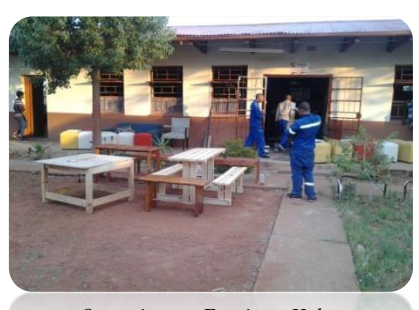
Operations at Furniture Hub

The business provides carpentry and upholstery services. It is currently managed by 5 local youth members with the assistance of 2 elderly women who specialises in upholstery. The business started operating late 2012 and has experienced its fair share of challenges and successes.