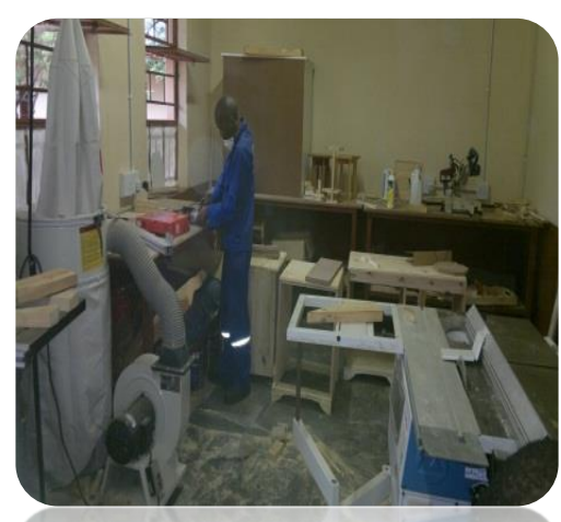
Operations at Furniture Hub