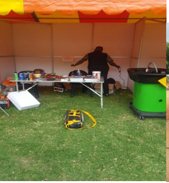
Bizniz in a Box